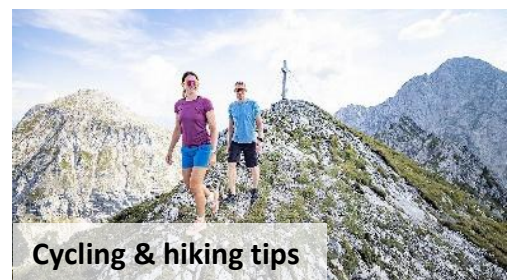
Cycling & hiking tips