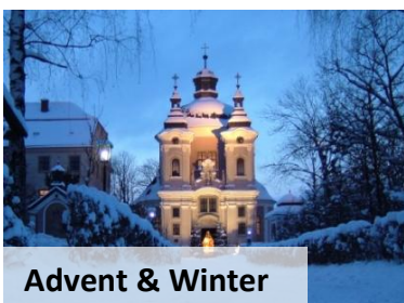
Advent & Winter