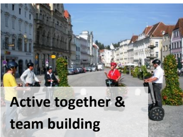
Active together & team building