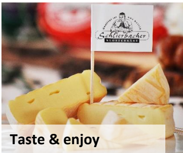
Taste & enjoy