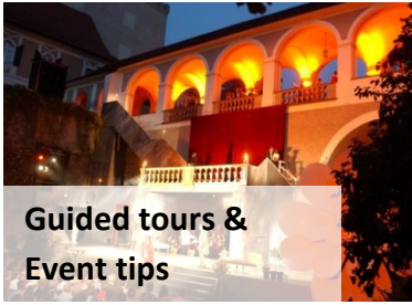
Guided tours & Event tips